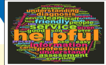
Feedback from people who have accessed the service put into a word cloud

A locally contracted and managed diagnostic service for adults who may have Autism Spectrum Disorder across Cheshire and Wirral, who do not meet the threshold for community learning disability services.